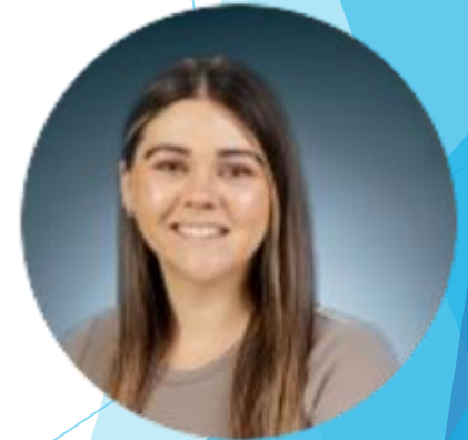
Early Years Phase Leader (Nursery and Reception)