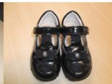
Girls outdoor shoes