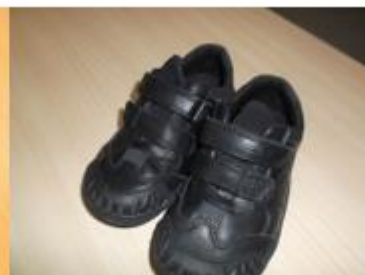
Boys outdoor shoes