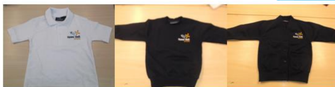
White polo shirt