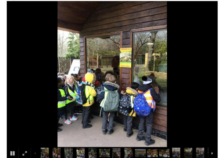
Trip to Hertfordshire Zoo!