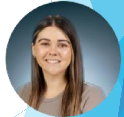
Early Years Phase Leader (Nursery and Reception)