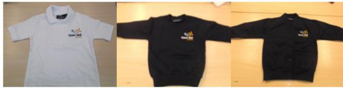
White polo shirt