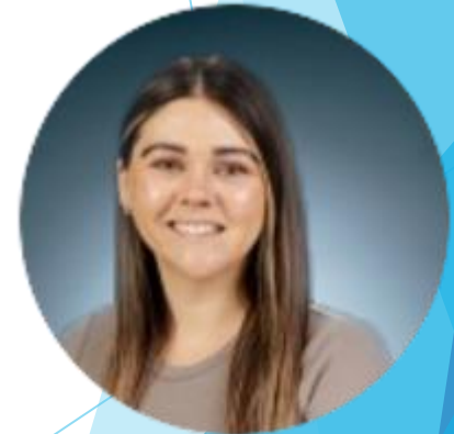
Early Years Phase Leader (Nursery and Reception)