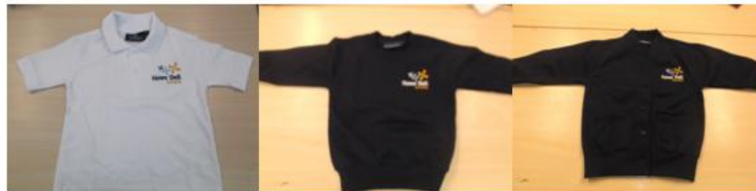
White polo shirt